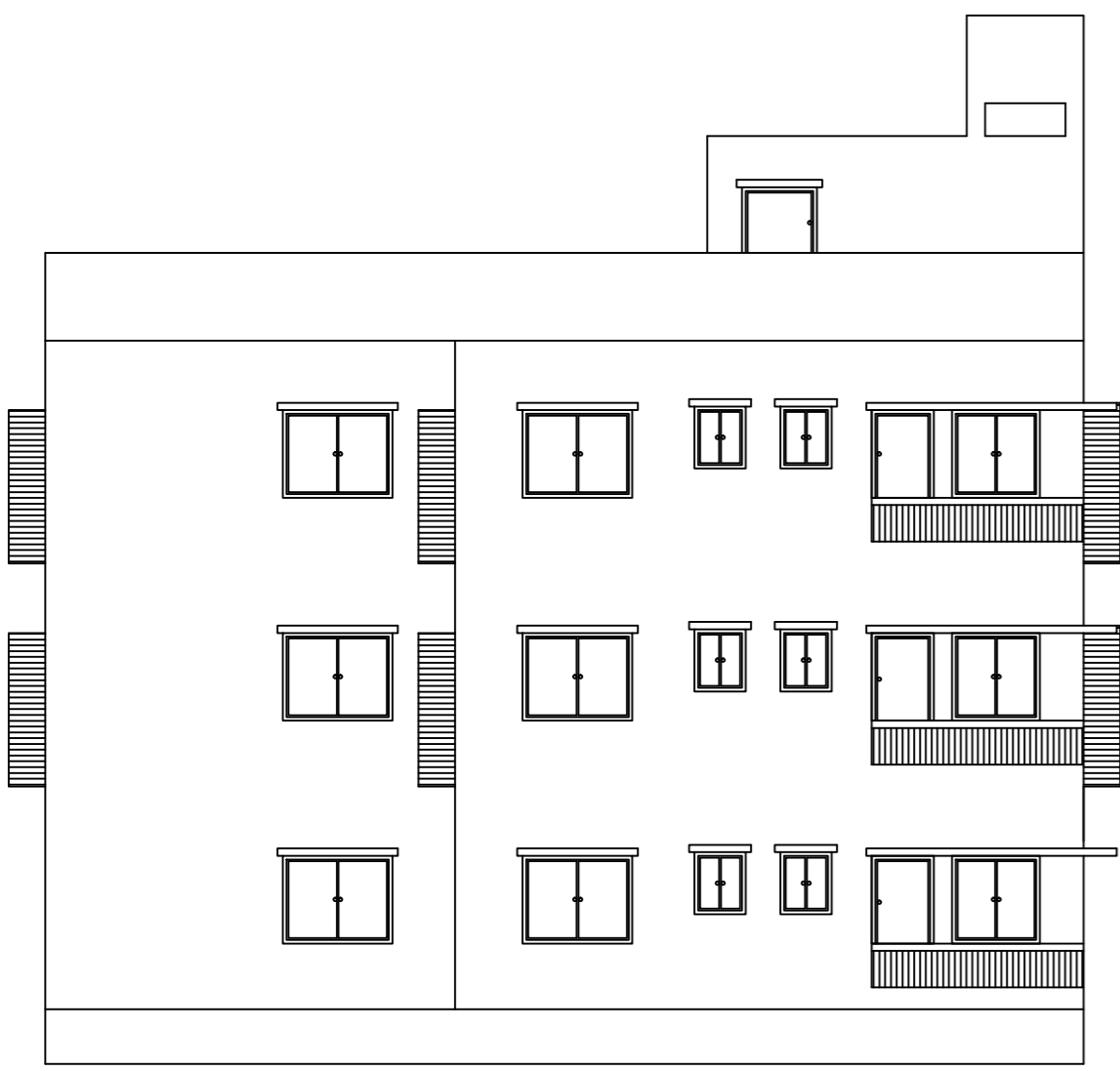
NORTHERN SIDE ELEVATION SCALE :- 1 : 100

DIGITAL SIGNATURE FOR E.E SHEET NO(2/2) DIGITAL SIGNATURE FOR A.E SHEET NO (2)